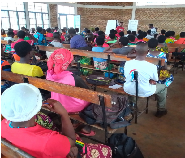
Awareness-raising session for SG members on nutrition education in Bukemba commune, Rutana province