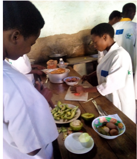
Out-of-school youth getting hands-on training in culinary arts in Bujumbura Province