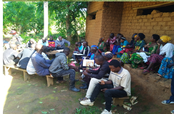
Solidarity groups exchange sessions during which members contribute every week to fund income generating activities (shops selling agricultural goods, agribusiness, raising livestock, brick-making, renting motorcycles, etc)