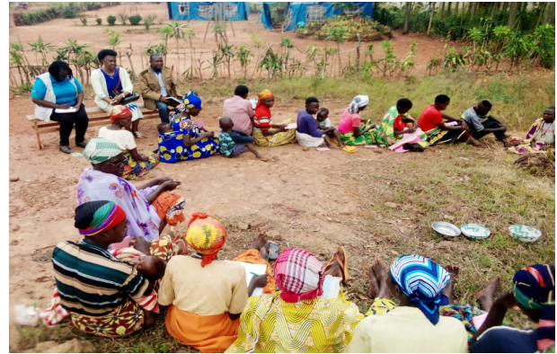
Supervision of activities by the Legal Representative of FVS-Amie des Enfants of the members of the Solidarity Groups employing the "Nawe n'uze" approach in Mutaho commune, Gitega province.

various hills. FVS-Amie des Enfants received support from Care International: to set up a Gender Policy and draw up its 2022-2026 Strategic Plan.