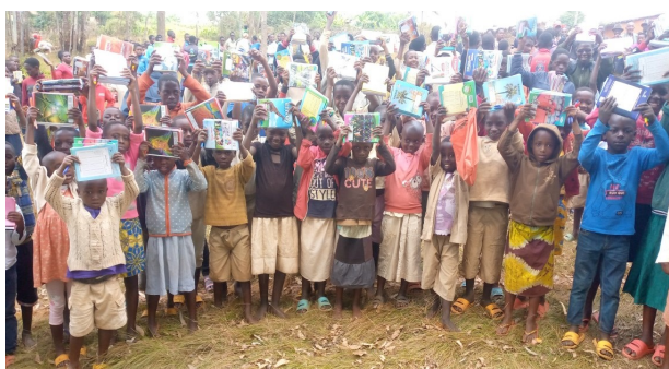
Children's joy after receiving school kits from solidarity groups