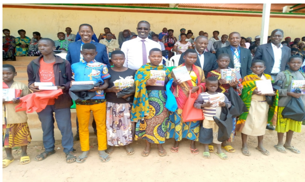
Participation of the Governor of the Province of Bururi in the Solidarity Group (SG) school kit distribution campaign for OVC

FVS-Amie des Enfants has continued to strengthen the families caring for OVC in solidarity groups. One of their missions is to contribute to the schooling of OVC under their supervision.