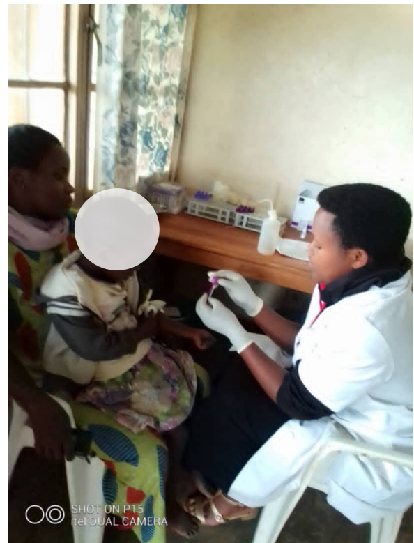
One of the nurses at our Socio-Medical Center in Bururi providing health services

follow-up. These patients all benefit from biological monitoring and psychosocial support. Some HIV/AIDS activities are carried out under the USAID-funded "WIYIZIRE" project, which FVS-Amie des Enfants is implementing in consortium with COPED as the lead partner and other organizations. In provinces where we have no social medical centers, people living with HIV are referred to public health structures for medical care.