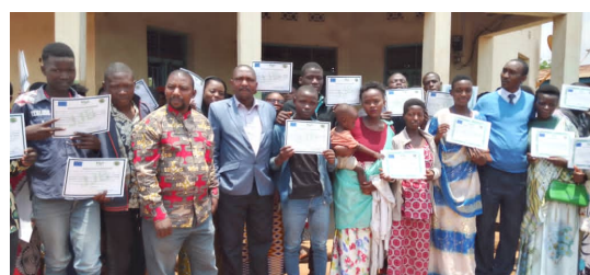
Ceremony to award certificates to young people following vocational training in the commune of Gitega