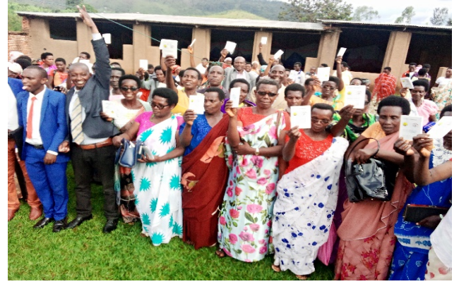
Family photo after an exchange session on the "MTT" community health card in Rumonge commune

During the year 2022, 3,661 households have joined the MTT health mutuals , comprising 14,157 beneficiaries (5,028 women and 9,129 men), including cards held by 202 OVC (118 girls and 84 boys) living in single households and purchased by members of solidarity groups.