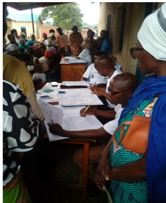
Registration of births in Makamba, commune Nyanza-Lac, Muyange zone, where the majority of returnees from Tanzania are registered

for FVS-Amie des Enfants staff, representatives of children's rights protection committees and solidarity groups, and heads of partner basic schools. A total of 1,474 people were trained (910 women and 564 men).