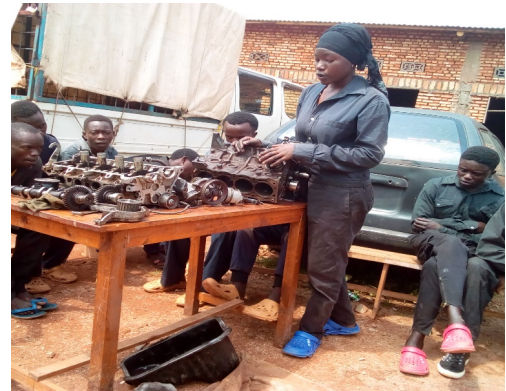
Out-of-school youth in mechanics training, Gitega commune