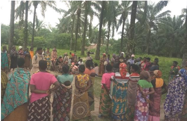
Discussion sessions for SG on membership into community health mutuals and the fight against GBV in Bubanza province