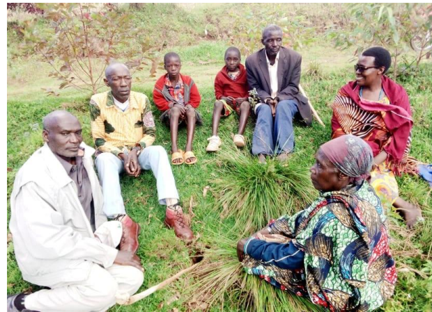
Two children reintegrated into their families on Nanira Hill in Bururi Commune