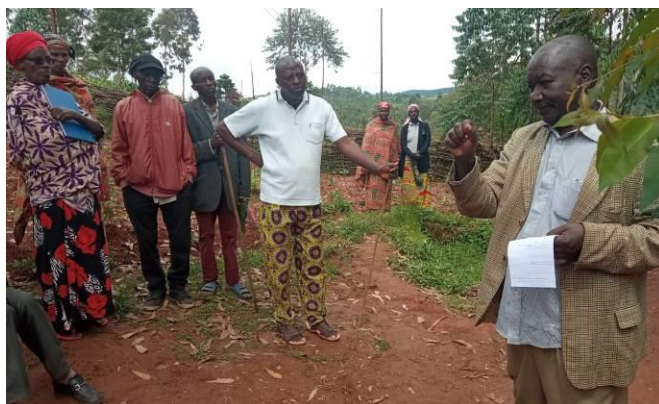
Mugozi Hill Chief at a community mediation session for OVC in Bururi province