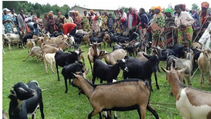
Distribution of goats to members of a FCAP community in Bururi province