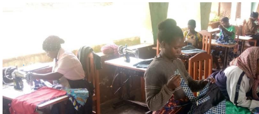
Sewing training in Gitega Province