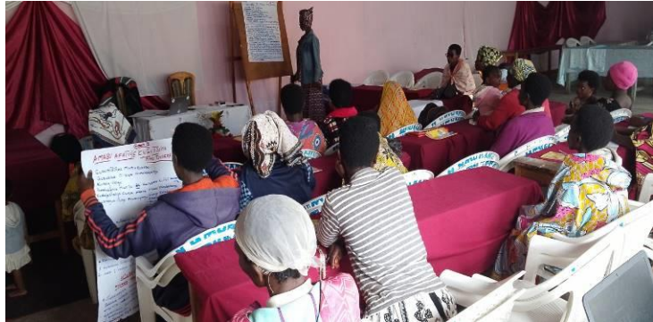
Training for PLHIV as part of the Fight AIDS Monaco-funded project