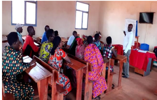
Workshop for elected women and their spouses on social responsibility in Gitega province